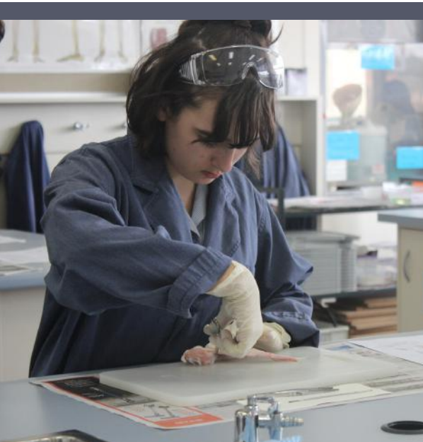
Year 9 Biology - Dissection