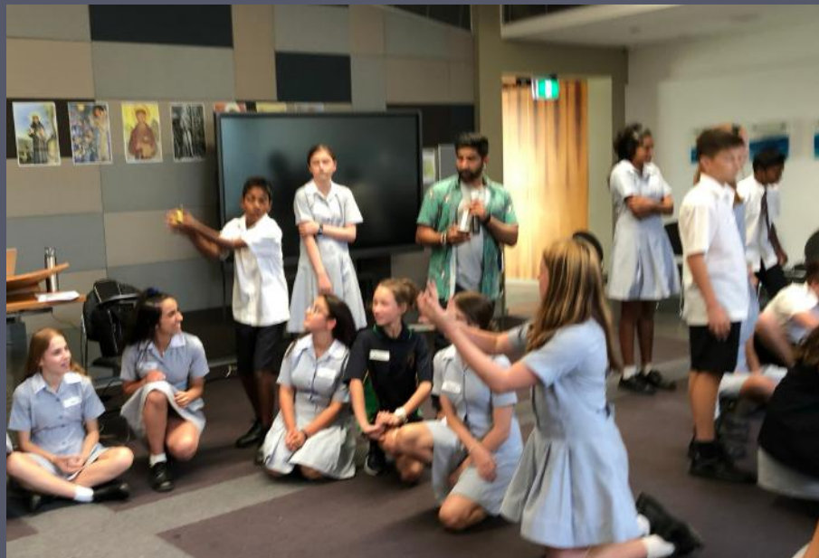
Student Leadership Training